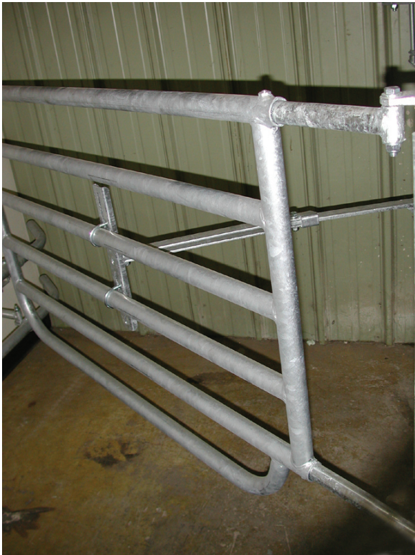
Telescoping, adjustable gate mounting bracket