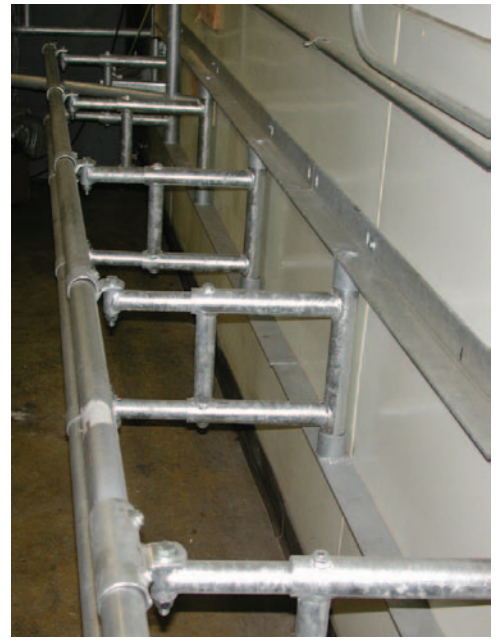
Indexing brisket rail