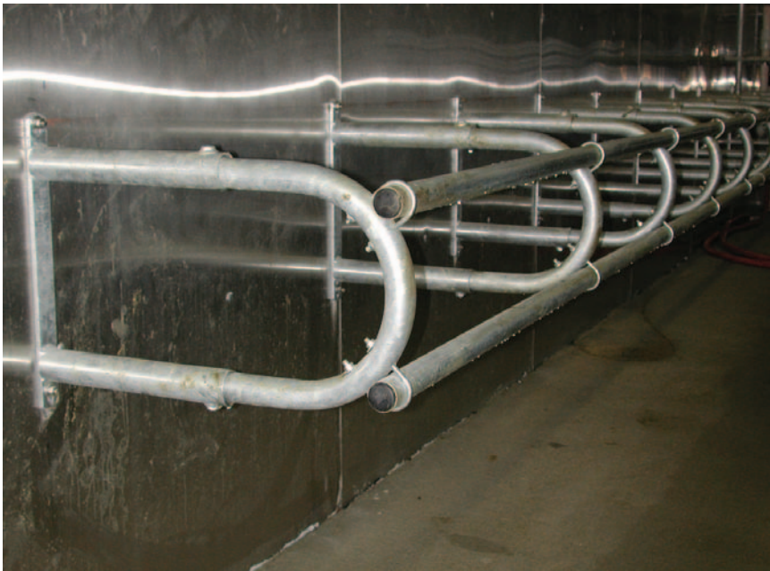
Stationary brisket rail