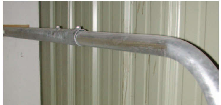
Telescoping, adjustable arch support